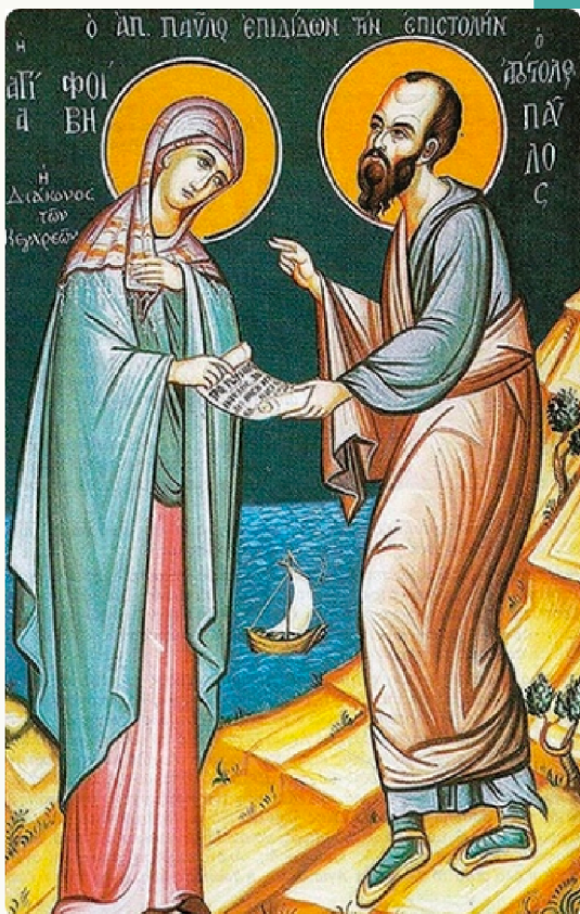
"St. Phoebe and St. Paul Icon" Unknown origin.