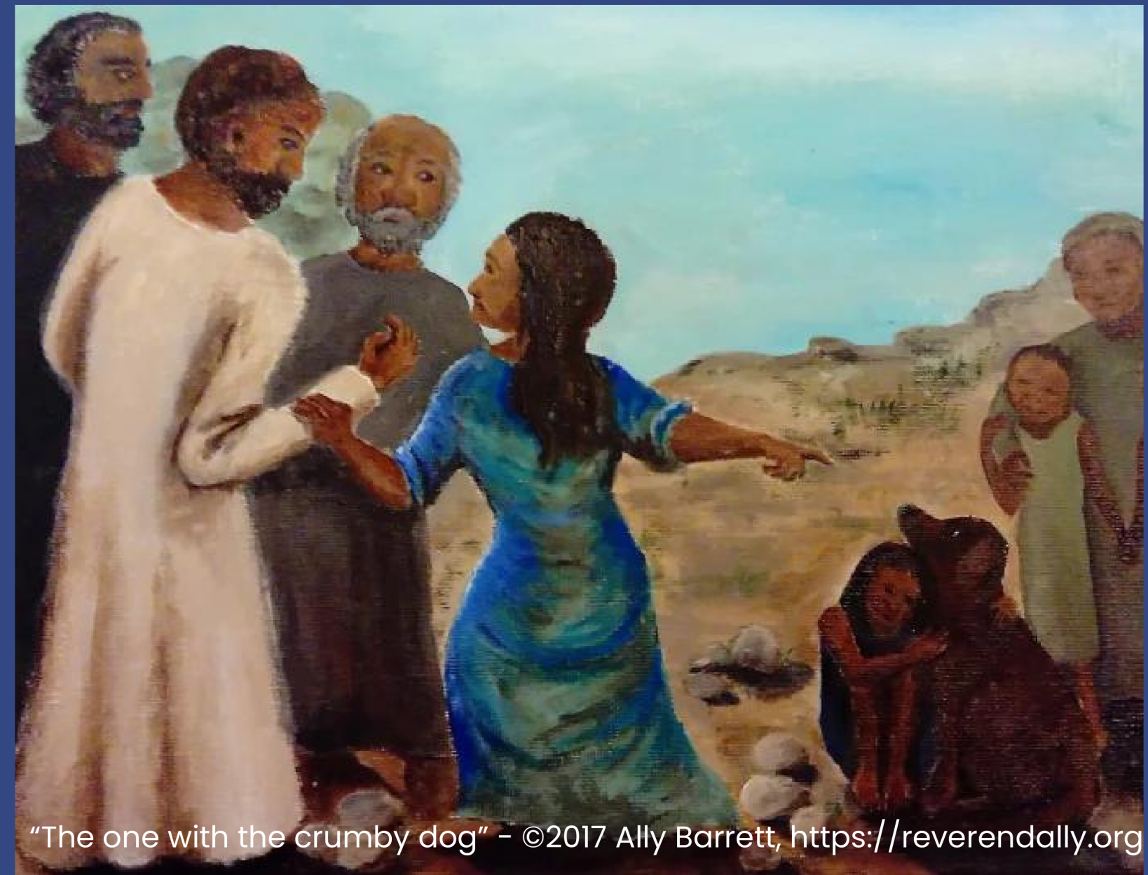
"The one with the crumby dog"

Then Jesus went from that place and withdrew to the region of Tyre and Sidon. And behold, a Canaanite woman of that district came and called out, "Have pity on me, Lord, Son of David! My daughter is tormented by a demon." But he did not say a word in answer to her. His disciples came and asked him, "Send her away, for she keeps calling out after us." He said in reply, "I was sent only to the lost sheep of the house of Israel." But the woman came and did him homage saying, "Lord, help me." He said in reply, "It is not right to take the food of the children and throw it to the dogs." She said, "Please, Lord, for even the dogs eat the scraps that fall from the table of their masters." Then Jesus said to her in reply, "O woman, great is your faith! Let it be done for you as you wish." And her daughter was healed from that hour.