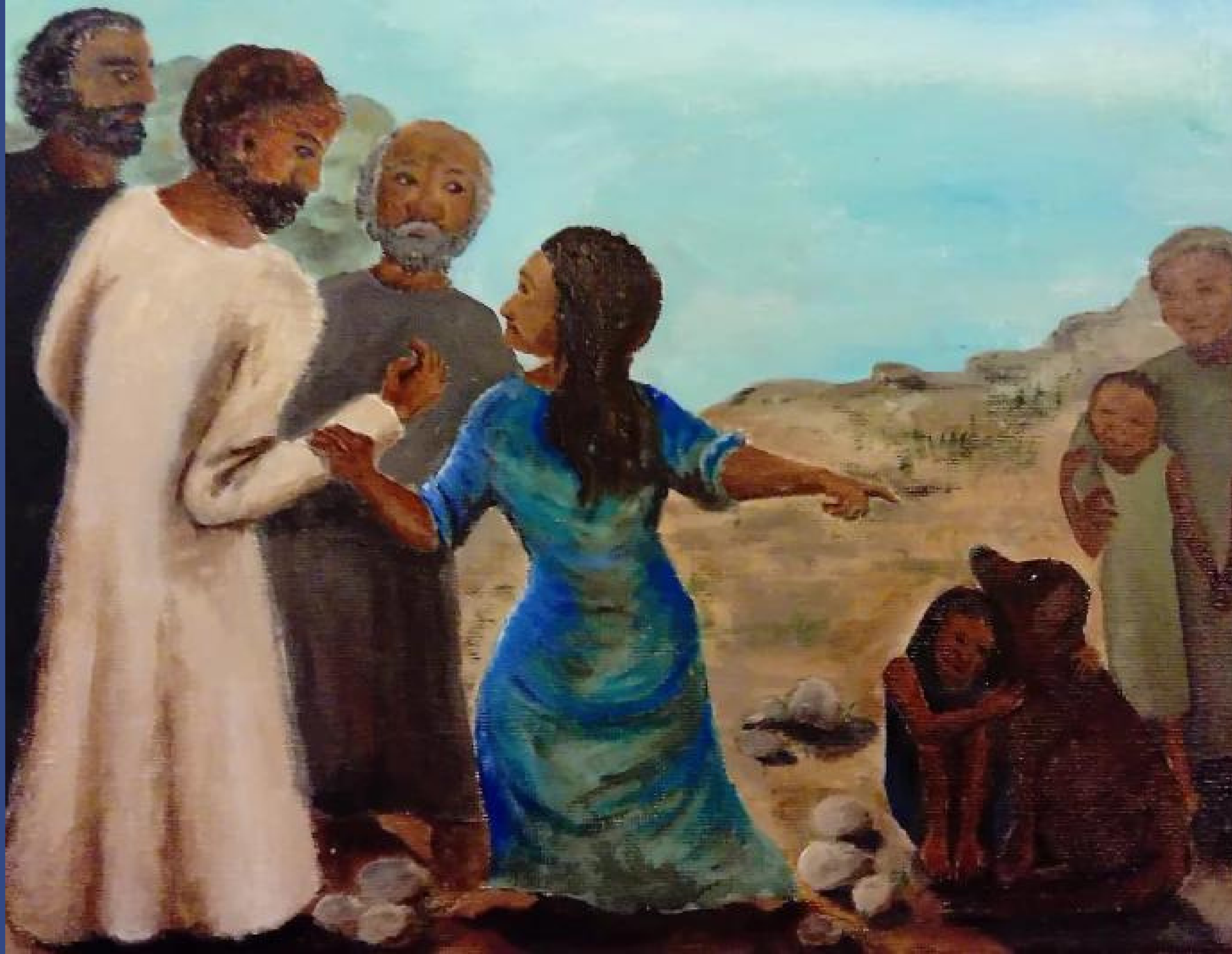
"The one with the crumby dog" ©2017 Ally Barrett https://reverendally.org